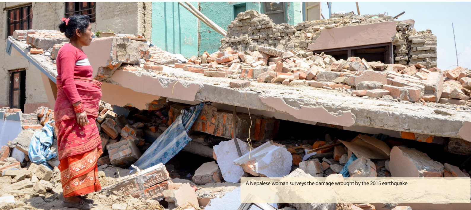
A Nepalese woman surveys the damage wrought by the 2015 earthquake

Malnutrition rates may rise in emergencies as access to proper nutrition becomes more difficult. This puts children at risk of stunting and long-term physical and mental impairment. When required World Vision promotes specialist infant and young child feeding, including feeding support in communities for children at risk of malnutrition and micronutrient deficiency, as well as for pregnant and lactating mothers.