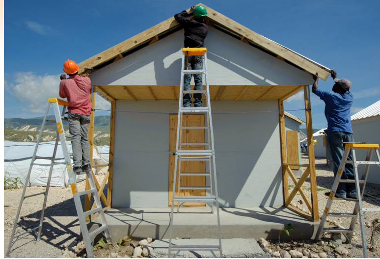
World Vision builds transitional housing in Haiti following the 2010 earthquake