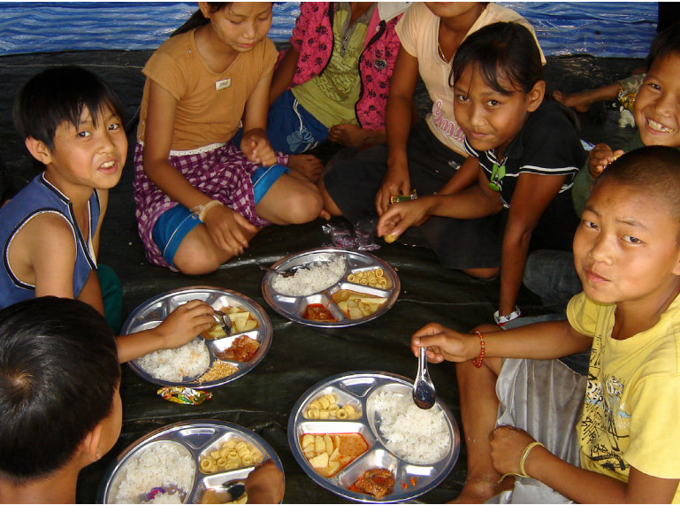
Thai children enjoy lunch provided at a World Vision child friendly space following the Indian Ocean Earthquake

Various assistance options are used, depending on context, including mixed food ration distributions, cash for food, food for work, and the use of vouchers to exchange for food in markets. Our relationship with the World Food Program makes World Vision one of the biggest food management agencies in the world, distributing in camps, settlements and within urban and rural environments. The aim is to restore food security and livelihoods, and ensure the most vulnerable children and their families are targeted.