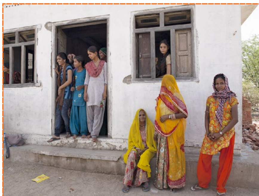
The study team conducted field work in slum communities in Jaipur.

In relation to interpreters, World Vision staff reported difficulties in engaging suitably qualified people available for the task. This situation meant that interviews were sometimes conducted through World Vision staff, which was undesirable due to their connections to the ADP, and at other times with inadequately qualified external interpreters.