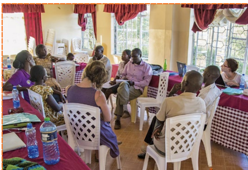
Members of the field work team and the external consultants during a debrief and reflections exercise at the end of a day's data collection.