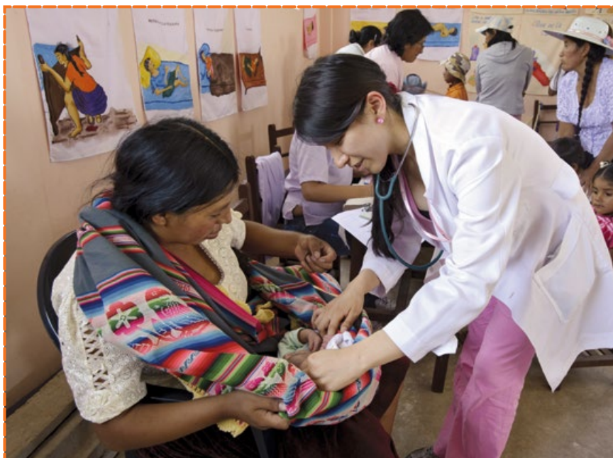
By focusing on healthcare, the Bolivia project was able to address issues of gender equality.

A glance at the summary table indicates greater levels of overall improvements in gender equality in the San Lomerío community of Bolivia. The Bolivia project was a four-year project that focused on community health and was based on a model of working through women's groups. It worked with women primarily as a means of achieving greater outcomes in health through better knowledge and practices, rather than for the benefit of women or for gender equality. Although the project focused on health, training was provided to women on broader themes, such as self-esteem, gender equality and rights. There was also livelihood training, mainly for women.