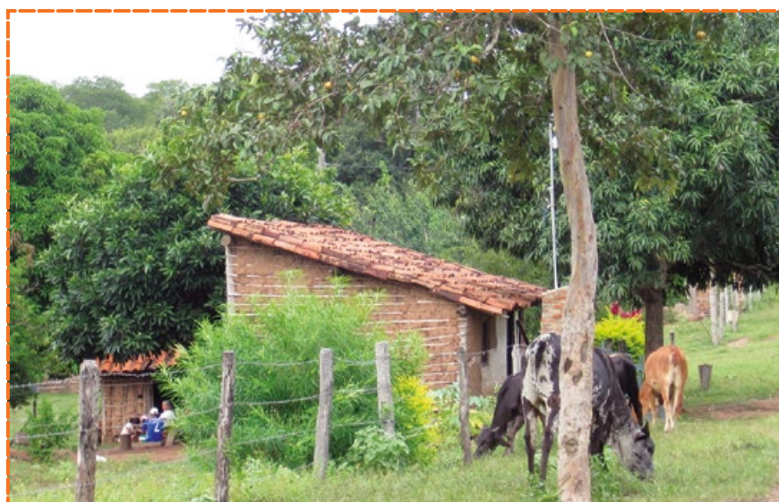
Typical house in Monterito community, San Antonio de Lomerío.

Two interpreters were assigned throughout to assist during workshops and in field interviews, as noted above. Both were congenial and highly conscientious, and fully understood the professional and technical nature of their role. They were also excellent sources of background and contextual information. However, their English fluency was not at a level sufficient to enable full and accurate exploration during interviews. World Vision Bolivia took great pains to ensure the smooth running of workshops and data gathering and analysis, including in the more remote sites of field work.