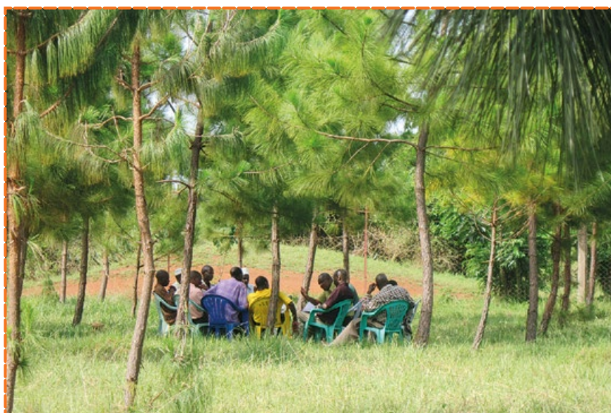
Men's focus group discussion, Ruhita ADP.

On 11 December, the study team interviewed district government staff working in the areas of education and community development. Afterwards they worked with World Vision staff to review and discuss all data collected. On 12 December, the study team returned to Dar es Salaam and conducted additional interviews with key informants from NGOs and universities who had been unavailable previously.