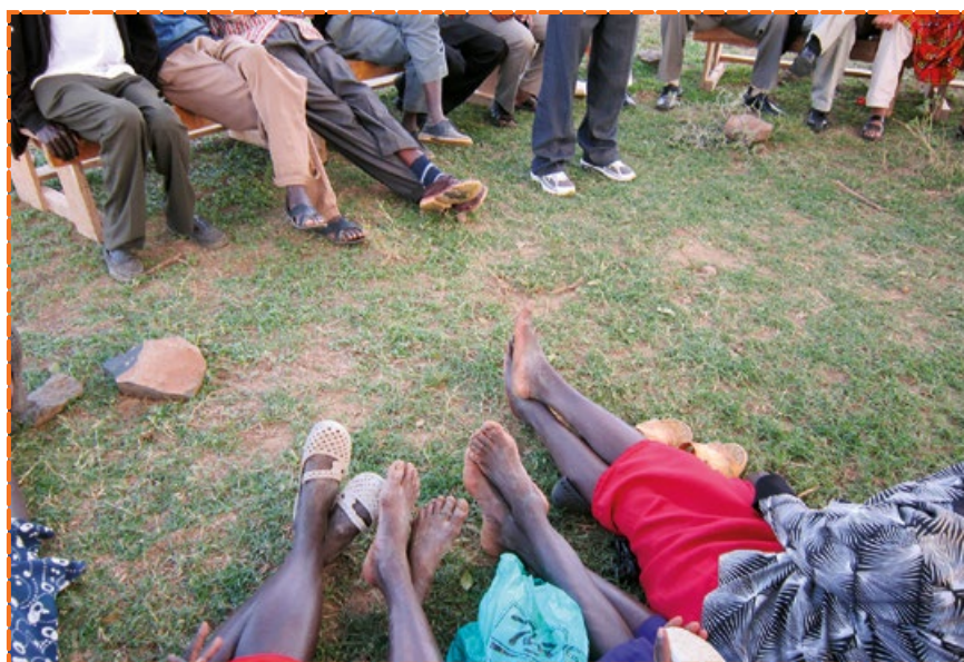
Men and women are sitting down together, but the men are all sitting on chairs. The women have to sit on the floor. The men all have very beautiful shoes, but the women have no shoes or poor quality ones. Photo and text by Joseph.

While it was perceived that there were more opportunities for women to participate in community decision-making forums, it is also clear that considerable inequalities remain. This photo and text provided by one of the data collection team members illustrates the current situation well.