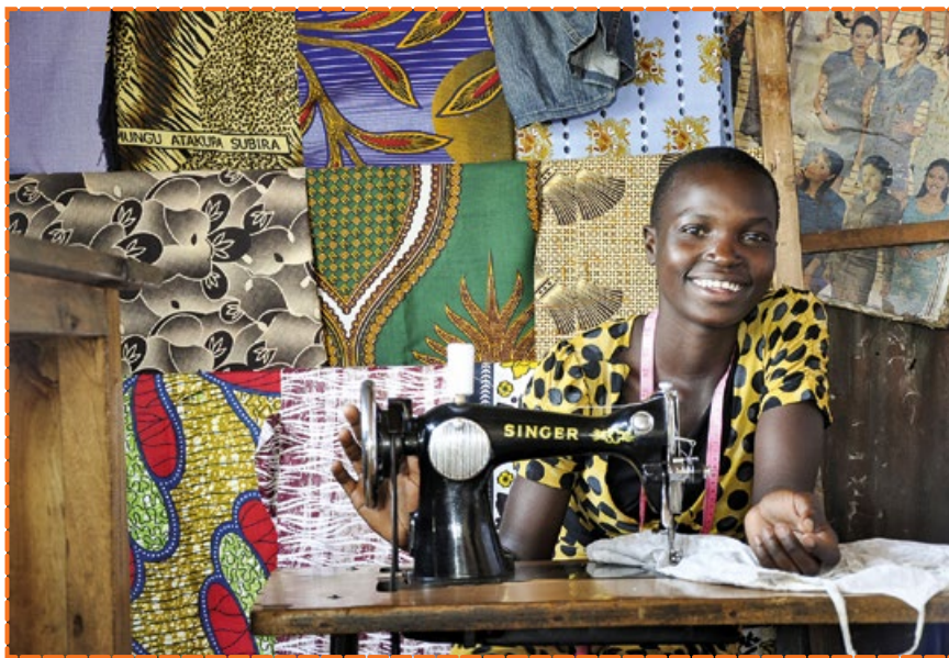
It is a change in our communities - women are now getting involved in some economic activities to get income. text by Joseph.

Women's increased opportunities for income generating were perceived to have a range of benefits for women and their children, including facilitating increased access to education for daughters, and reduced vulnerability to family violence.