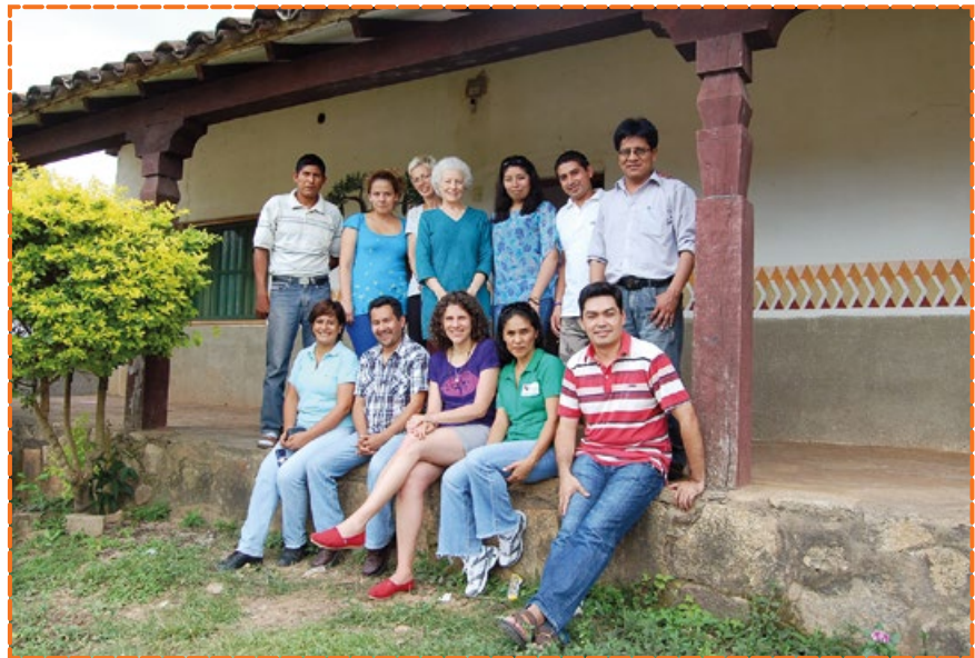
Field work team members in San Antonio de Lomerío.