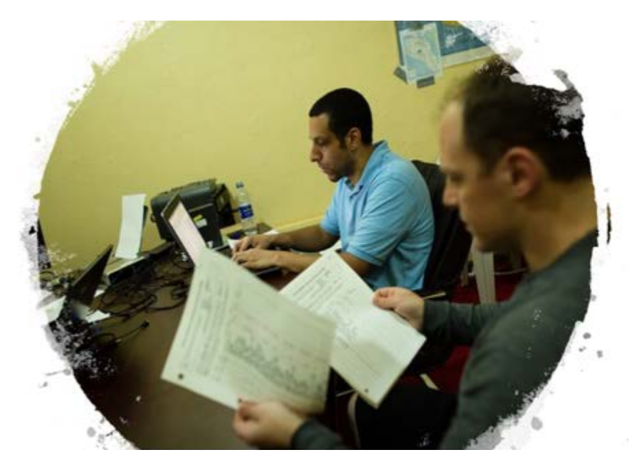
USAID Ebola Recovery Liberia