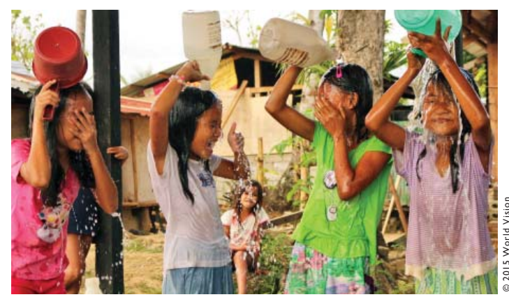
These young girls are enjoying having access to safe water in their community, thanks to your support.

"And if anyone gives even a cup of cold water to one of these little ones who is my disciple, truly I tell you, that person will certainly not lose their reward"