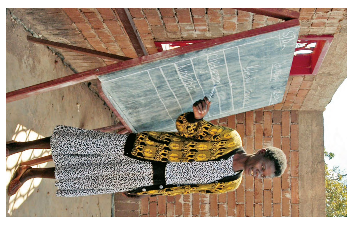
Permission to reproduce is granted.