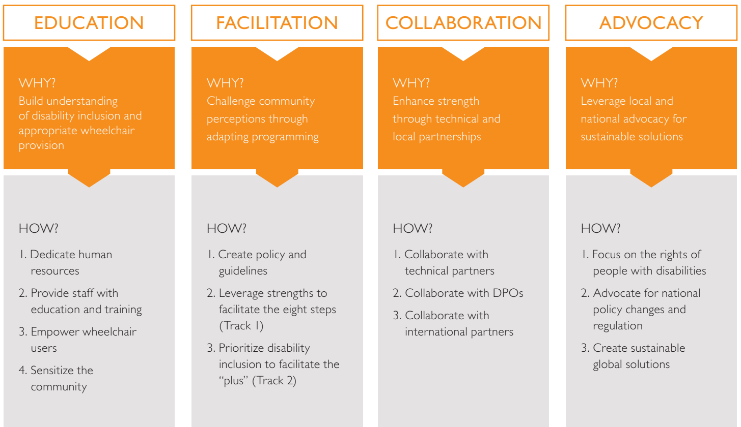
FIGURE 2: The four pillars that support the 8 Steps+ approach. The “why” section communicates the importance of the pillar to the overall process; the “how” section presents key actions to begin implementation.

shown in Figure 2, with a fuller discussion of each in the section that follows, including case studies, sidebars, and illustrative examples. Please also reference Appendix 3: The 8 Steps+ and Community Development Organizations for more information.