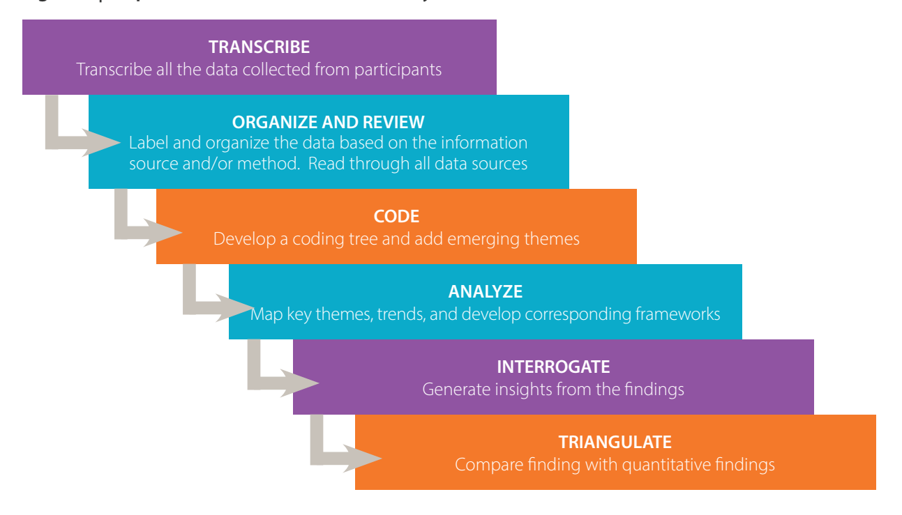
Figure 9 | Steps for GESI Qualitative Data Analysis<sup>74</sup>

Qualitative analysis analyzes non-numerical GESI disaggregated data such as feelings, thoughts, and perceptions.