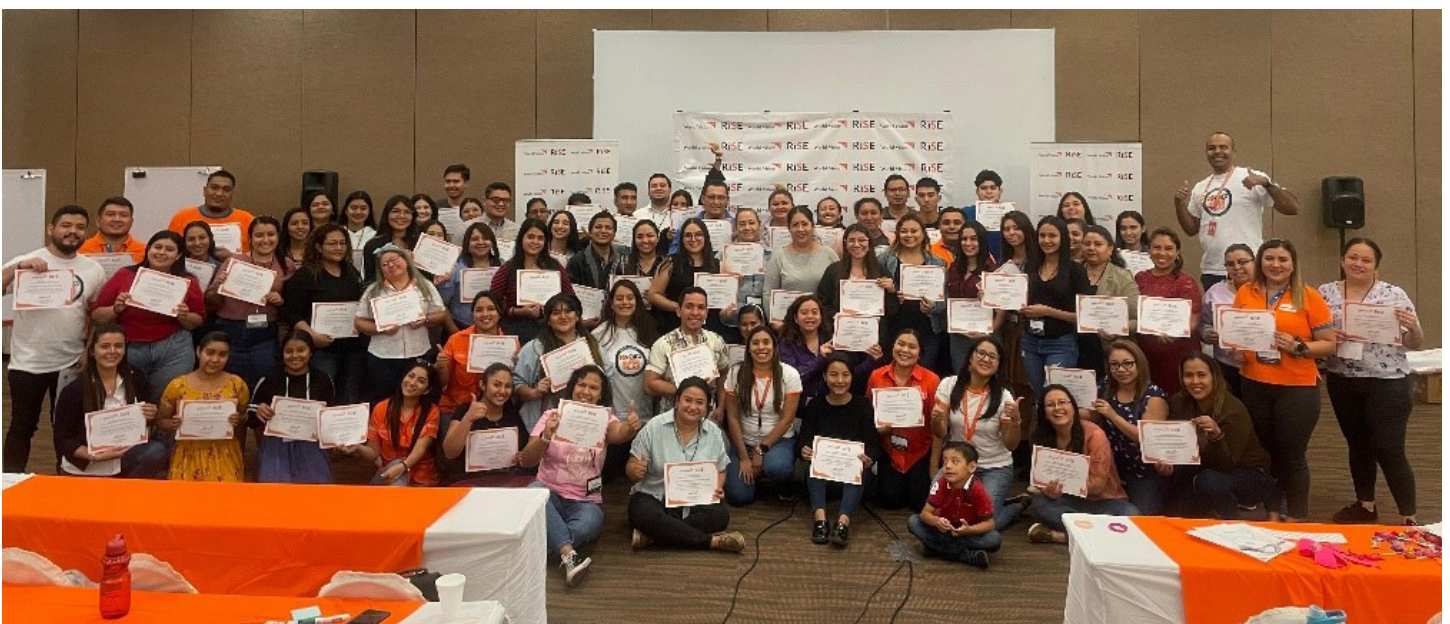
Participants of the Youth Ready facilitators training in El Salvador smile with their certificates of completion.

Additionally, we partnered with TECOLOCO, the Ministry of Labor and Social Welfare of La Libertad, the Lamarr Project of the European Union, Gerardo Barrios University, IOM, and Lutheran University to support employment and entrepreneurship initiatives. We are also collaborating with UNIVO and CDMYPE UNIVO to refer youth to RISE and aid aspiring entrepreneurs, and the National Industrial Technical Institute is offering training courses for RISE participants.