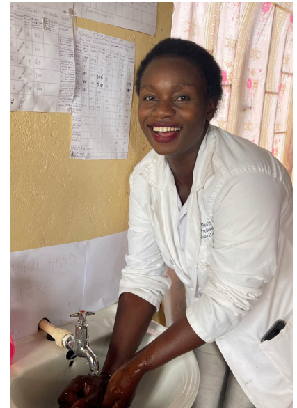
Through Citizen Voice and Action groups, the Zambia WASH Program helped community members apply for government funding for piped-water systems in schools and health facilities (like the newly constructed sink pictured above). As a result, 18 applications were approved by the government in Pemba, Zambia.

The WASH team also joined with several partners to train councilors, ward representatives, committee members, and representatives of government ministries on disability inclusion and legislation that addresses disability issues.