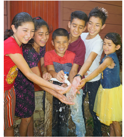
Children, including these in the La Ruidosa community, enjoy access to clean water. Having clean water available helps reduce high rates of infant mortality related to intestinal diseases and poor nutrition. In addition, ready access to clean water removes the risks faced by women and children when carrying water, such as physical injury from lugging heavy containers or violence experienced on desolate roads.

In addition, we trained 110 micro-watershed committees to create a plan to maintain the water sources.