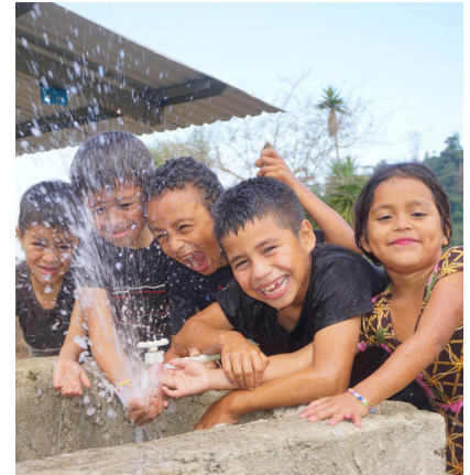
Children celebrate as water starts flowing in our project in La Virtud. In Santa Elena, World Vision installed a photovoltaic system that pumps water using solar energy. The technological innovation is environmentally friendly and reduces electrical costs in poor and vulnerable communities.

The water management committee in the community of Canadas, where we plan to construct a water system, includes several women, including the committee president. The committee promotes wider participation in implementing the project, serving as an example of World Vision’s emphasis on gender, equity, and social inclusion.