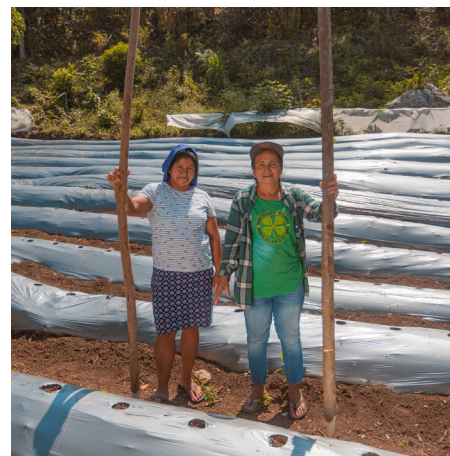
Two women stand in front of their planted vegetables in Honduras. This year, THRIVE provided specialized training to women whose main income source comes from agriculture.