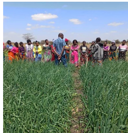
Women from Luwingu, Zambia, participate in a learning visit to witness the impact THRIVE has had on women in Mpika.

We are grateful for your partnership, and we praise God for the impact we've seen!