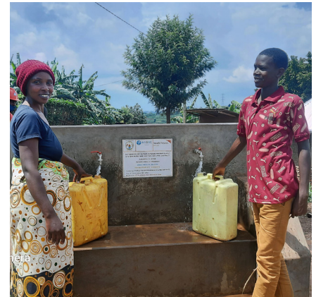
Residents of Rutare enjoy getting water from new community taps recently constructed through the support provided by donors like you.

Between October and March, we trained 298 faith leaders as WASH champions in Nyungwe, Ishema, Kivu, and Akagera. Pastors and other faith leaders are an integral part of promoting healthy hygiene behaviors, as they are highly trusted and valued figures in their communities.